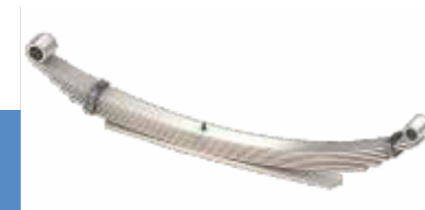
9 + 3 - ADDITIONAL LEAF SPRINGS