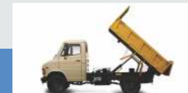
SEMI-FORWARD CAB DESIGN