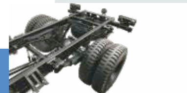
REINFORCED CHASSIS FRAME