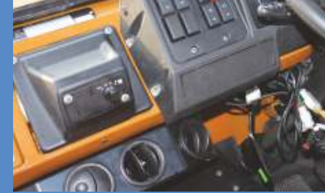
Truck Ventilation System