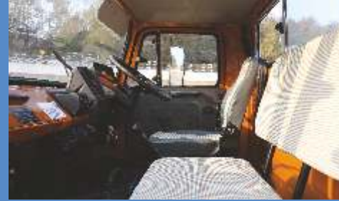
Driver Bucket Seat and Co-driver Bench Seat